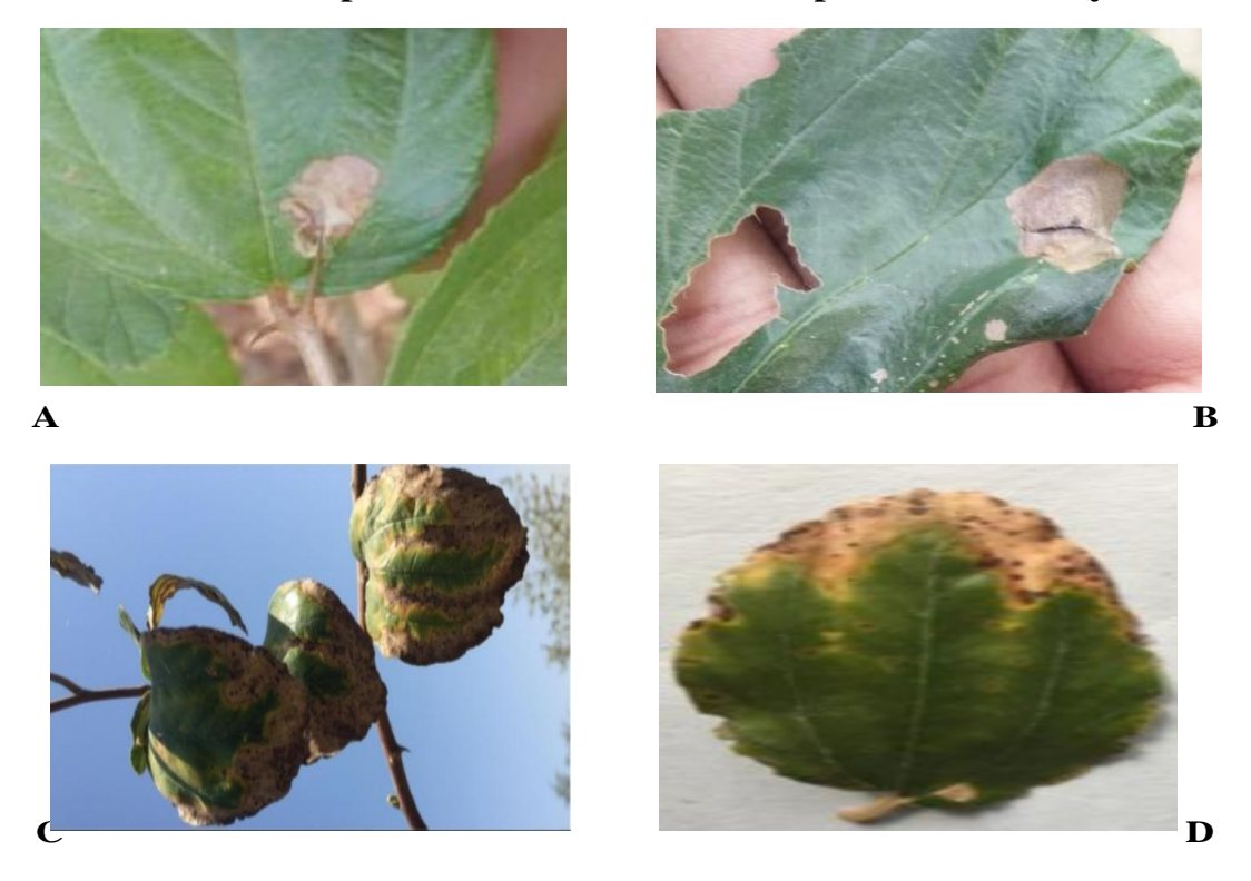
Symptoms of Alternaria leaf spot

Experimental field view of ber plant and healthy Leaves